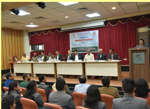
Delegates Present of the Dias

Panel Discussion was organized by Sandip Foundation's Department of Management Studies and School of Commerce and Management, Sandip University.